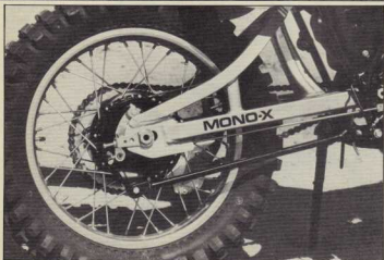
This will probably be the last year you'll see the traditional Yamaha Monoshock design. The factories are playing with a progressive setup similar to the Honda Pro-Links.