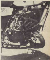
The "H" engine is now a 5-speed, and with the YEIS induction there's a noticeable improvement in the bottom end performance.

By the end of the day we had the YZ working as well as it was ever going to, in stock configuration. No doubt, you are asking the burning question as to how it compares to the Suzuki Floater rear end. Well, the Suzy single-shock works better, no argument there. However, the YZ is not that far off base. Just about the only place where the YZ suffers is on the killer, hold-the-bars-and-grit-your-teeth bumps.